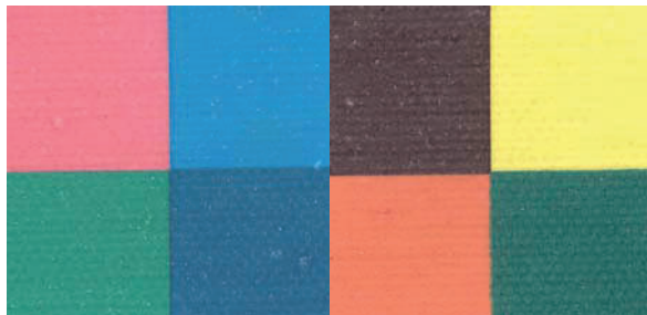
with Lascaux Transparent Varnish

This water-based 1-component product protects injected colours and fabric from UV radiation and makes them water resistant. By combining 1-UV gloss, 2-UV matt and 3-UV semi gloss a range of gloss intensities can be achieved.